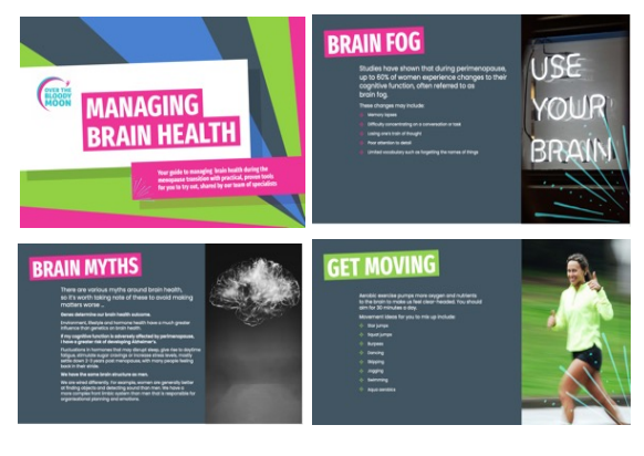
Symptom Management e-books