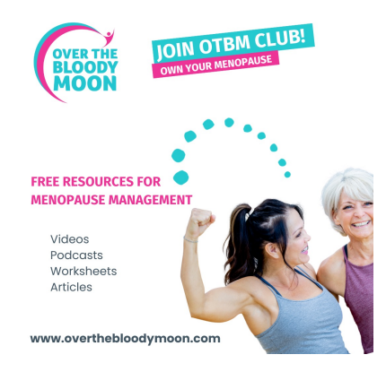
Free resources, events, newsletter

www.overthebloodymoon.com/shop www.overthebloodymoon.com/myotbmclub