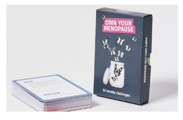
52 weekly menopause wellbeing cards